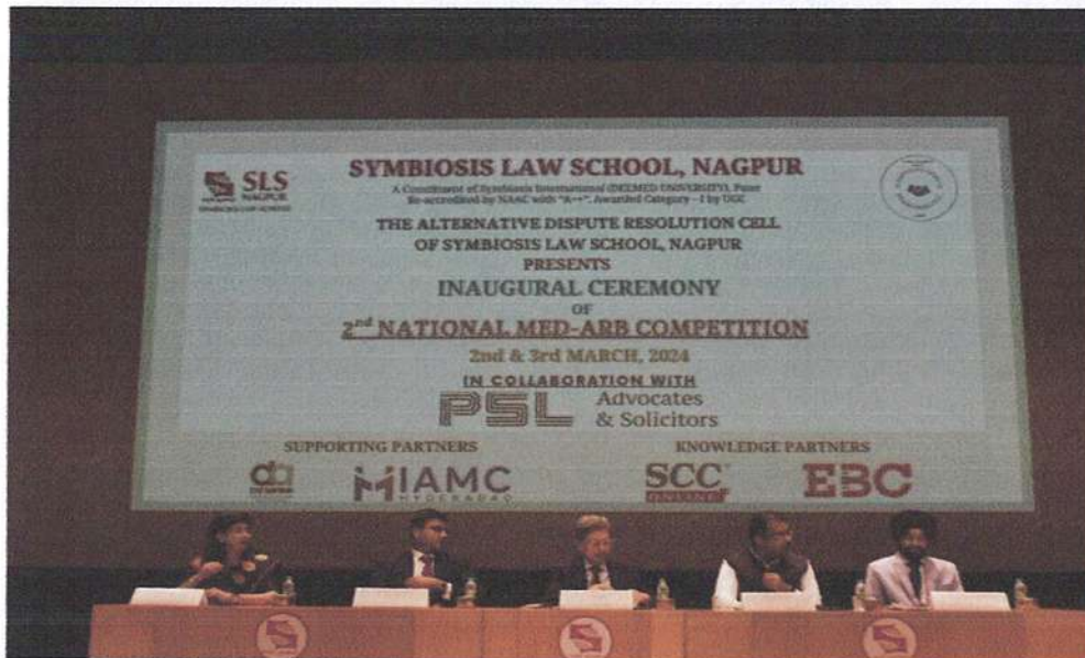
[THE INAUGURATION CEREMONY]