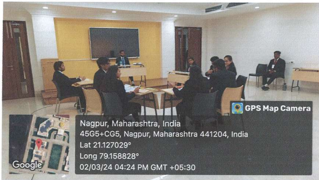
[SNEAK PEAK INTO THE MEDIATION SESSION OF THE PRELIMINARY ROUNDS]