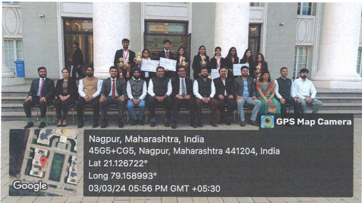
[ THE WINNERS WITH THE LUMINARIES ]