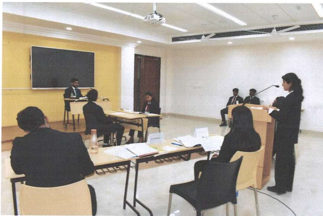
[ARBITRATION SESSION IN THE PRELIMINARY ROUNDS]