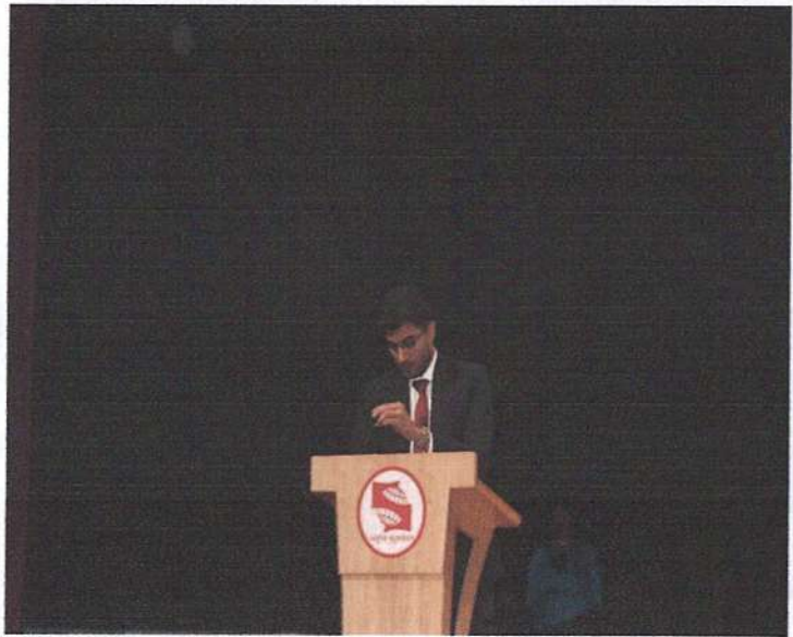
[GLIMPSES OF INAUGURATION CEREMONY]